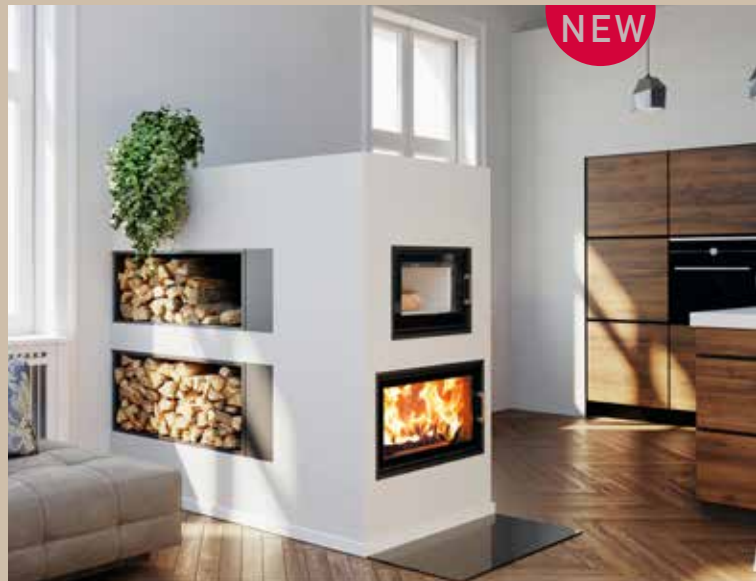
Fireplace insert with baking compartment

The new baking compartment for fireplace inserts allows you to use the energy from the fireplace insert for a fully functional baking compartment