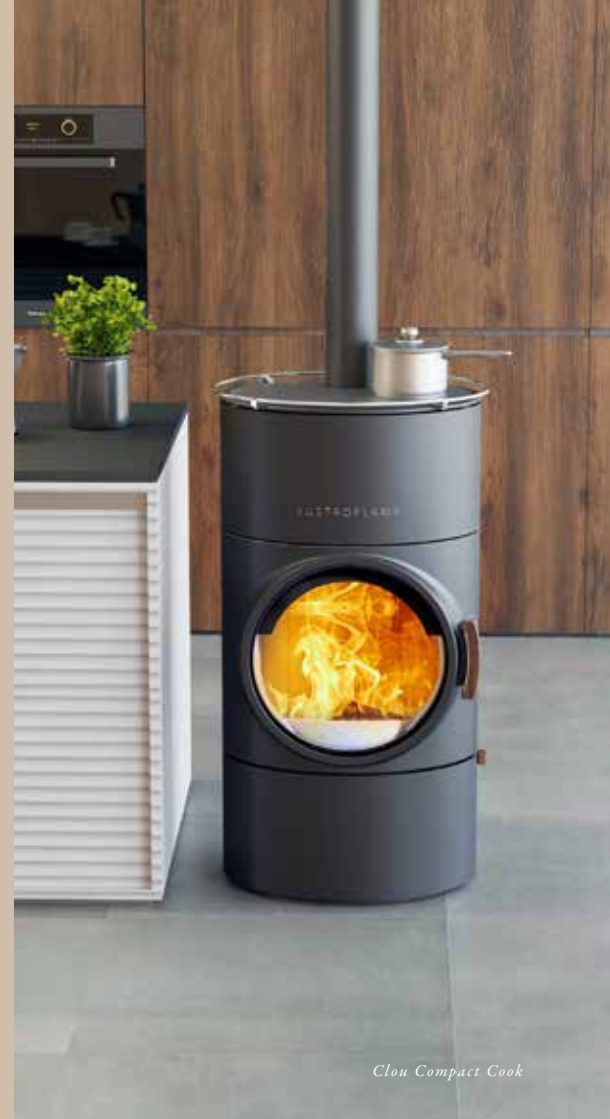
Clou Compact Cook